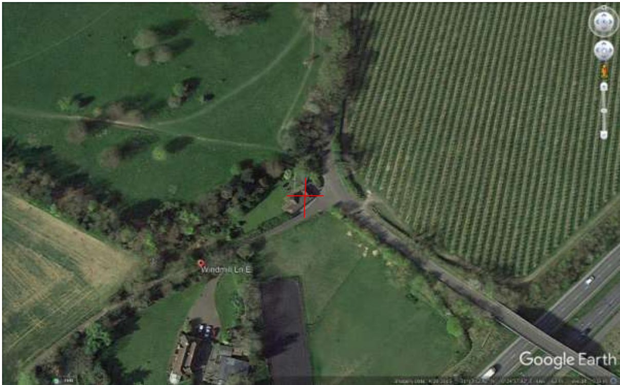
Plate 1. Aerial view of site (red target) showing the site prior to development.

(Google Earth 20/4/2017: Eye altitude 335m).