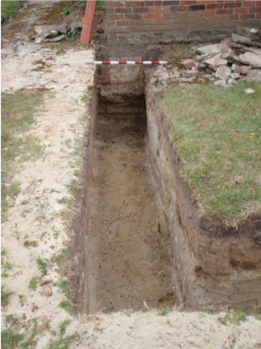
Plate 4. View of the foundation trench (looking south-east)