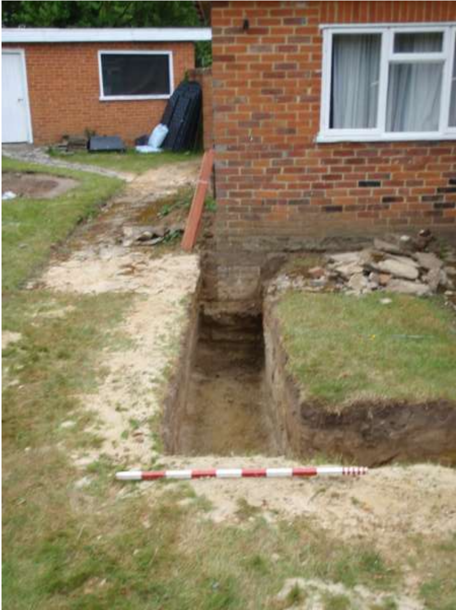
Plate 5. View of the foundation trench (looking north-east)