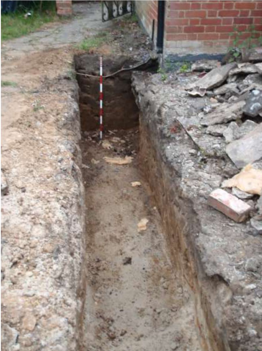
Plate 6. View of the foundation trench (looking north-east)