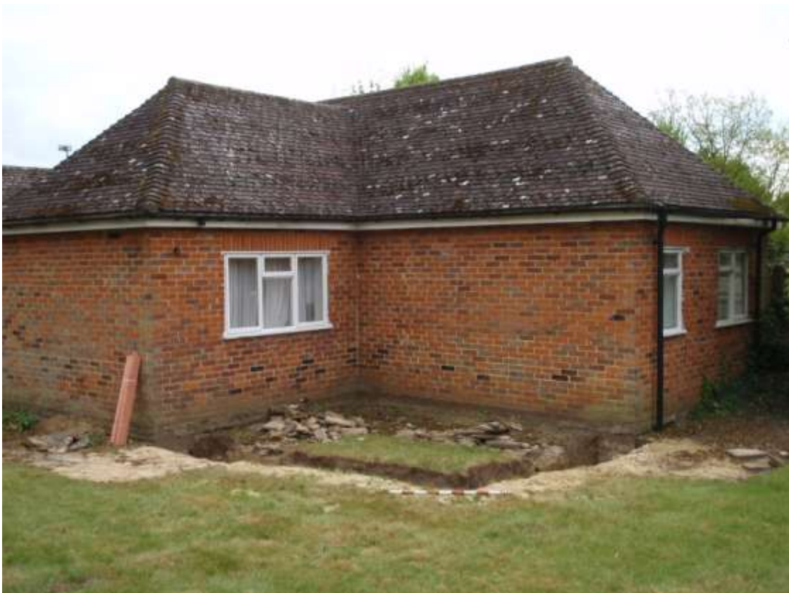
Plate 3. View of the site (looking south-east)