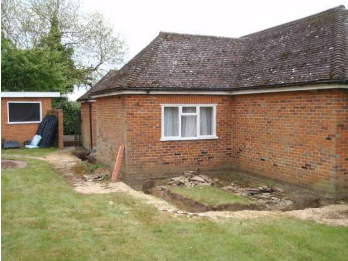
Plate 2. General view of site (looking north-east)